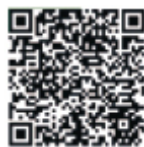
Village Venture Glentworth P. Council SCAN ME

OR with a QR Scan App on your mobile SCAN one of these QR Codes