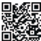
Village Venture Scampton Church SCAN ME