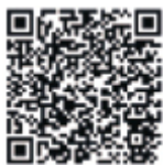
Village Venture Ingham P. Council SCAN ME

https://glentworth.parish.lincolnshire.gov.uk