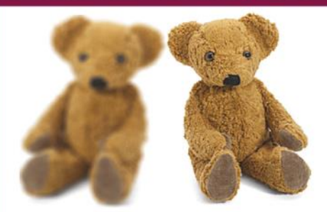
What they see