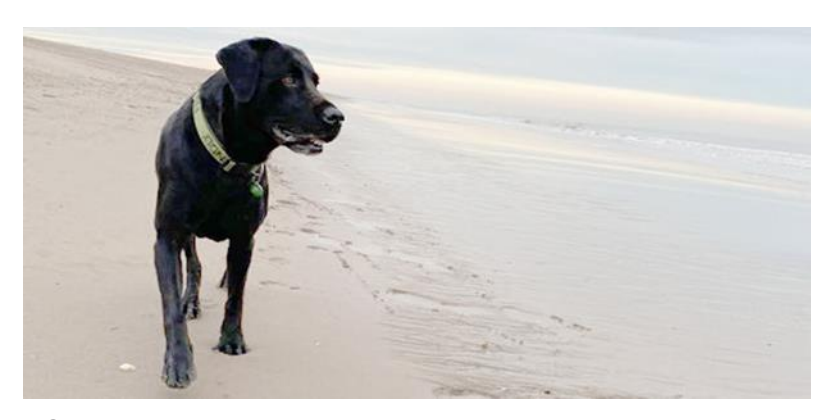
© 'Bomber' - Image courtesy of Walter Robinson

Please scan the 'SCAN ME' code below for current information on our website